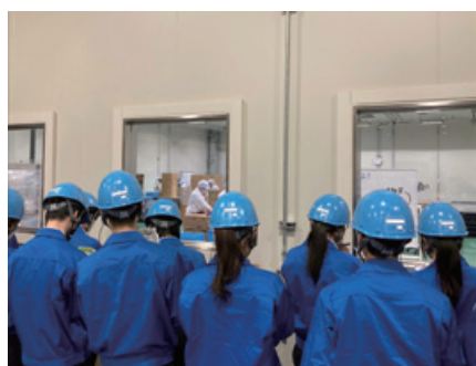
Worksite tour for new employees