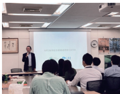
Training for candidates for overseas assignment