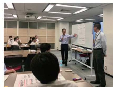
Training for those in managerial positions