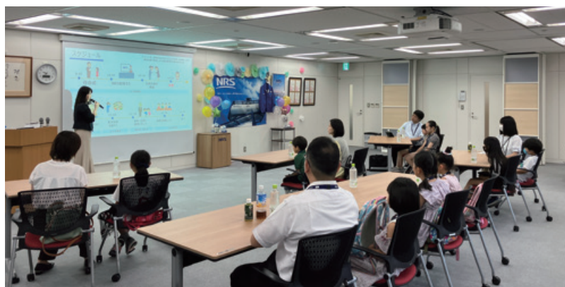
▲ Learning about the business of NRS

We arranged a day for the children of NRS employees to visit their parents' workplace. During the children's visit day, they have the opportunity to explore their parents' workplaces. This initiative is designed to enhance the children's understanding of the types of work their families are involved in, promote work-life balance, and foster communication within the company. We are dedicated to continuously enhancing employee engagement and offering learning opportunities to children, the leaders of the future.