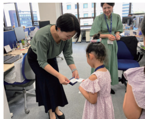
▲ Exchanging business cards with colleagues of parents