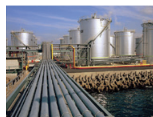
Tank terminal business