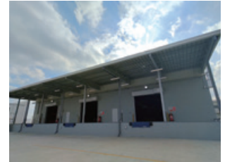
The first Japanese-quality hazardous materials warehouse in Vietnam

*AEO: Authorized Economic Operator. AEO system is a system in which customs approves and certifies operators that have established cargo security management and compliance systems and provides relaxed and simplified form of customs procedures.