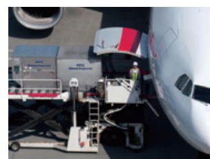
Freight forwarding business