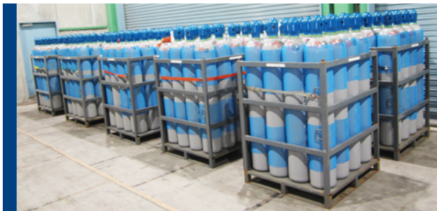
High-pressure gas storage