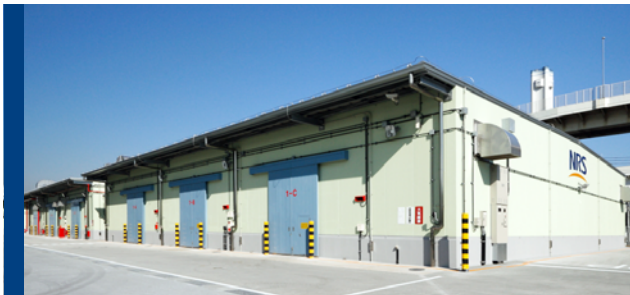
Hazardous materials warehouse (controlled temperature)