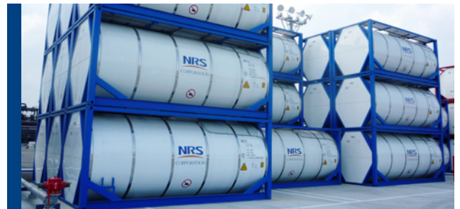
ISO tank container storage Liquid chemicals and empty containers