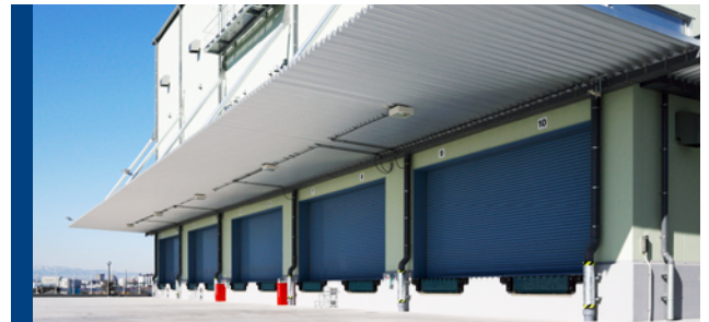
General goods warehouse (controlled temperature)