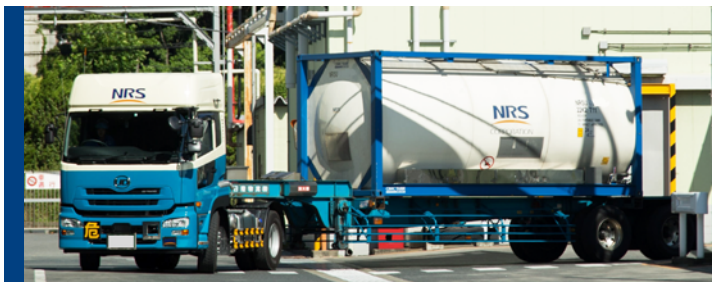
Transport tank container / controlled temperature truck transport