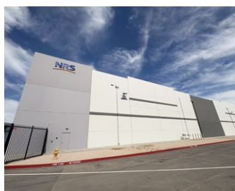
Hazardous materials warehouse

In May 2025, NRS established NRS LOGIOS AMERICA INC. in Arizona, USA, as a new comprehensive logistics site. As well as responding to strong demand for logistics relating to chemical products – particularly those connected with semiconductors and battery materials – this new company provides a range of logistics functions as a one-stop service with the aim of optimizing customers' supply chains. Together with NRS OCEAN LOGISTICS LTD. and NRS LOGISTICS AMERICA INC. of the NRS GROUP, NRS LOGIOS AMERICA INC. delivers optimized, high-quality logistics services.