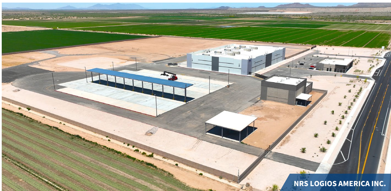
NRS LOGIOS AMERICA INC.

In May 2025, NRS established NRS LOGIOS AMERICA INC. in Arizona, USA, as a new comprehensive logistics site. As well as responding to strong demand for logistics relating to chemical products – particularly those connected with semiconductors and battery materials – this new company provides a range of logistics functions as a one-stop service with the aim of optimizing customers' supply chains. Together with NRS OCEAN LOGISTICS LTD. and NRS LOGISTICS AMERICA INC. of the NRS GROUP, NRS LOGIOS AMERICA INC. delivers optimized, high-quality logistics services.