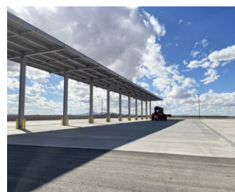
ISO tank container storage