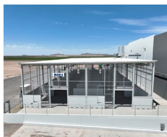
High-pressure gas pad