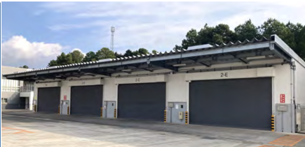
High-pressure gas storage