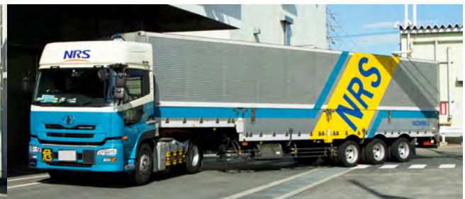
Transport tank container / controlled temperature truck transport

Images shown are for illustrative purposes