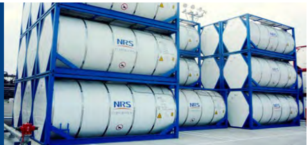
ISO tank container storage Liquid chemicals and empty containers