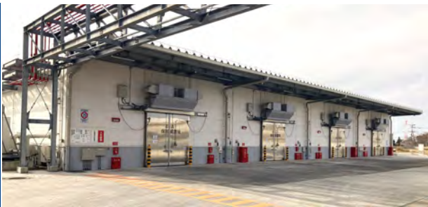
Hazardous materials warehouse (controlled temperature)