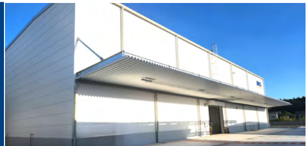
General goods warehouse (controlled temperature)